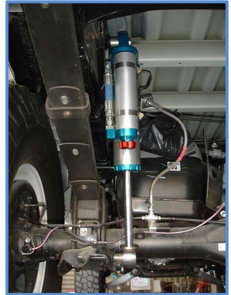
Remote Reservoir applications (2011-2015)