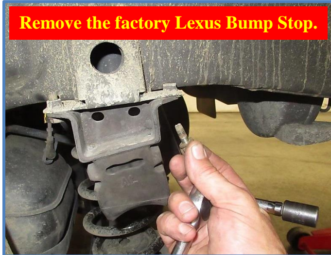
Remove the factory Lexus Bump Stop.